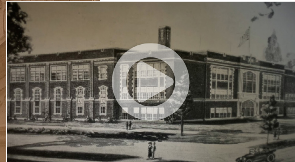
Click graphic to play Central Grade Historical Tour video

To ensure the next renovation reflects the community's vision, an ad-hoc committee formed, comprised of residents, parents, and educators.